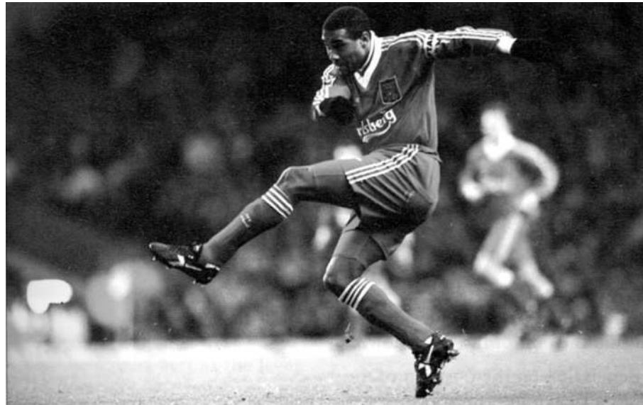
Figure 1 shows a footballer completing his shot at goal.